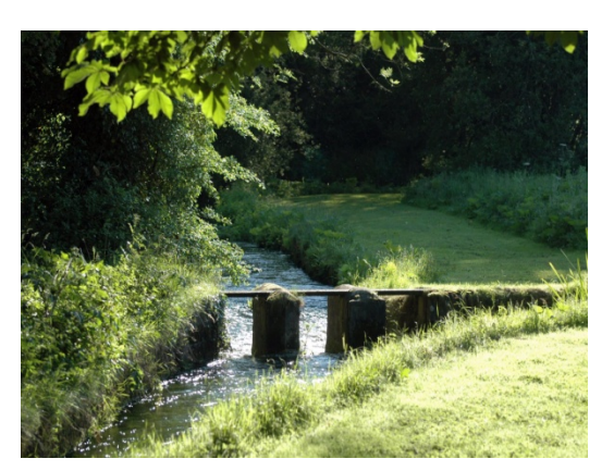
Hatches close to top of Beat 2