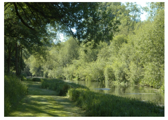
View upstream from start of Beat 2

some walk boards and back to the river. Immediately there is another pool (tricky to cast) and then on up to the pool immediately below the Mill Race. You are now back at the Cabin and the end of the beat.