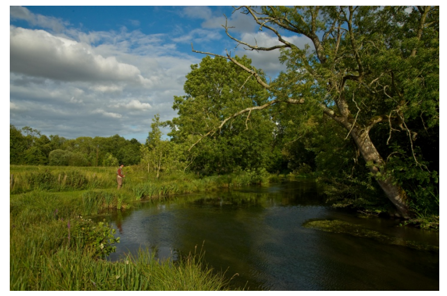
Ash Tree Corner

Looking upstream, all the fishing is on the left bank. Be careful as you cross the bridge; there are fish right under your feet as you cross. Between this bridge and the next bridge is a prime section of shallow water where fish are easy to spot. The first fifty yards or so after the second bridge are nothing much, but once you reach the tussocks go carefully. This bank is very spongy and all the fish lie in the undercut of your bank. We call this grayling alley, which takes you to the excellent Ash Tree