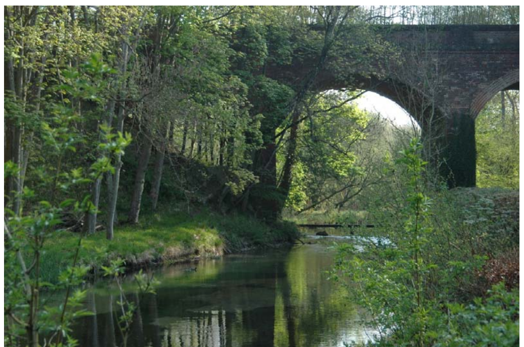
Viaduct. Fish on left and cross bridge to right

On a bright, sunny day fish lie in the deep on the opposite side. If you have waders you can slip into the water at the top. walk under the concrete bridge and fish the final 100 yards or so. We don't manage this in any