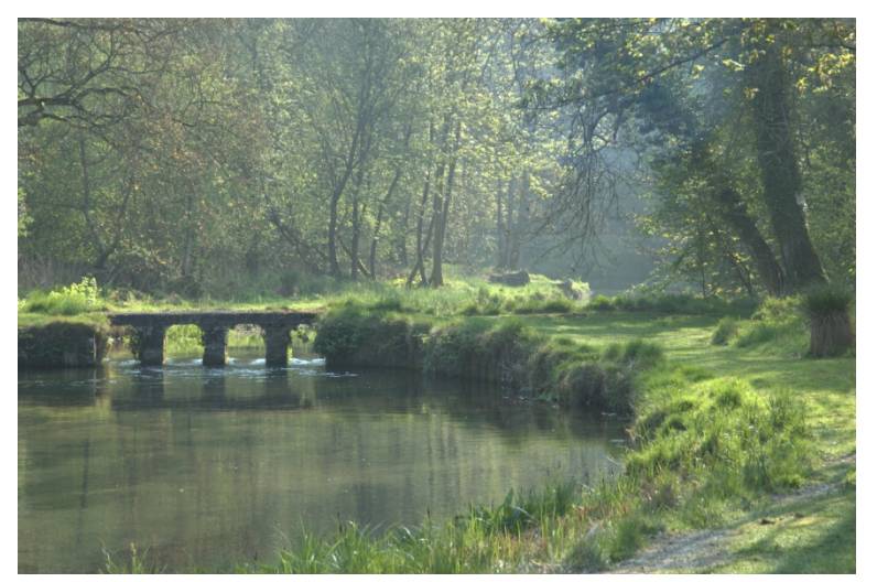
Top hatches. Crossing to left bank and eventually viaduct.

casting is tricky until you get past the footpath bridge, where the beat curves right and is fairly open until you reach the second, and top, hatch pool.