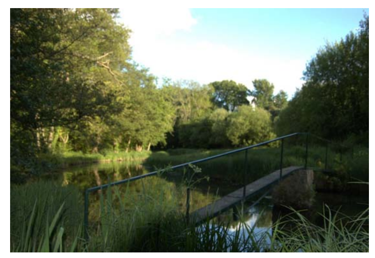
Venice Bridge looking onto Beat 3